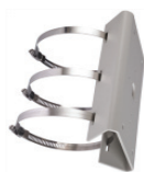
DP-1275ZJ Vertical pole mount