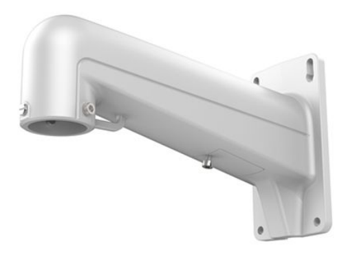
DP-1602ZJ Long-arm Wall Mount Bracket